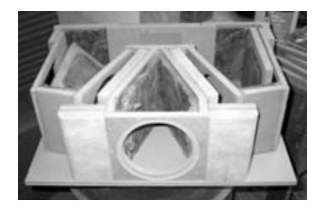
Interior of Vandersteen VCC-5 center channel speaker

All center channel speakers don't sound the same. All center channel speakers won't blend well with your main speakers. Listen and compare.