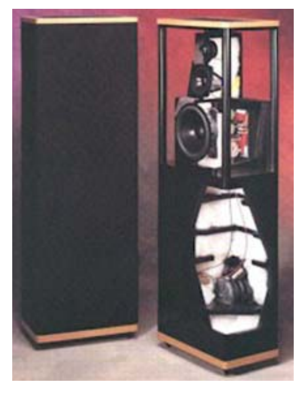
Vandersteen Model 3A Signature speakers

A connector plate on the back of each speaker features heavyduty barrier strip terminals that allow spade lug connections and biwiring or passive biamplification. Contour controls are provided to tailor response in the midrange and treble.